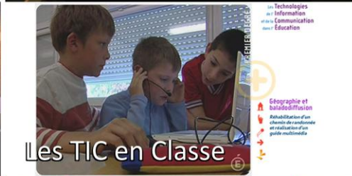
Les TIC en Classe