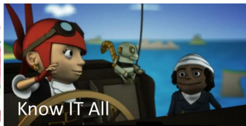
Know IT All