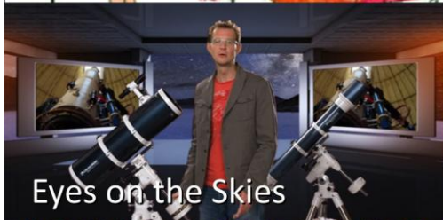
Eyes on the Skies